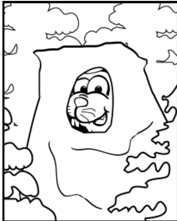
Huggar Rabbit peeking around his tree and from inside his bag.