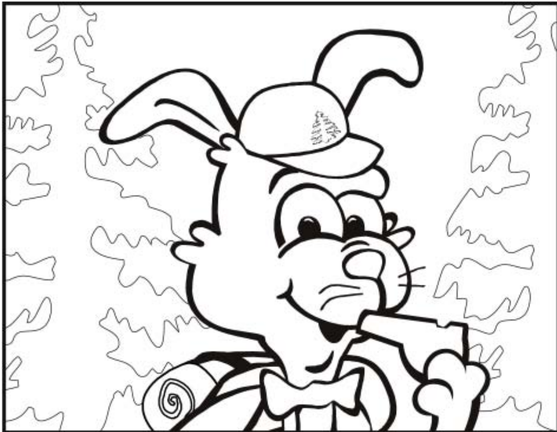
Huggar Rabbit demonstrating two ways to signal for help.